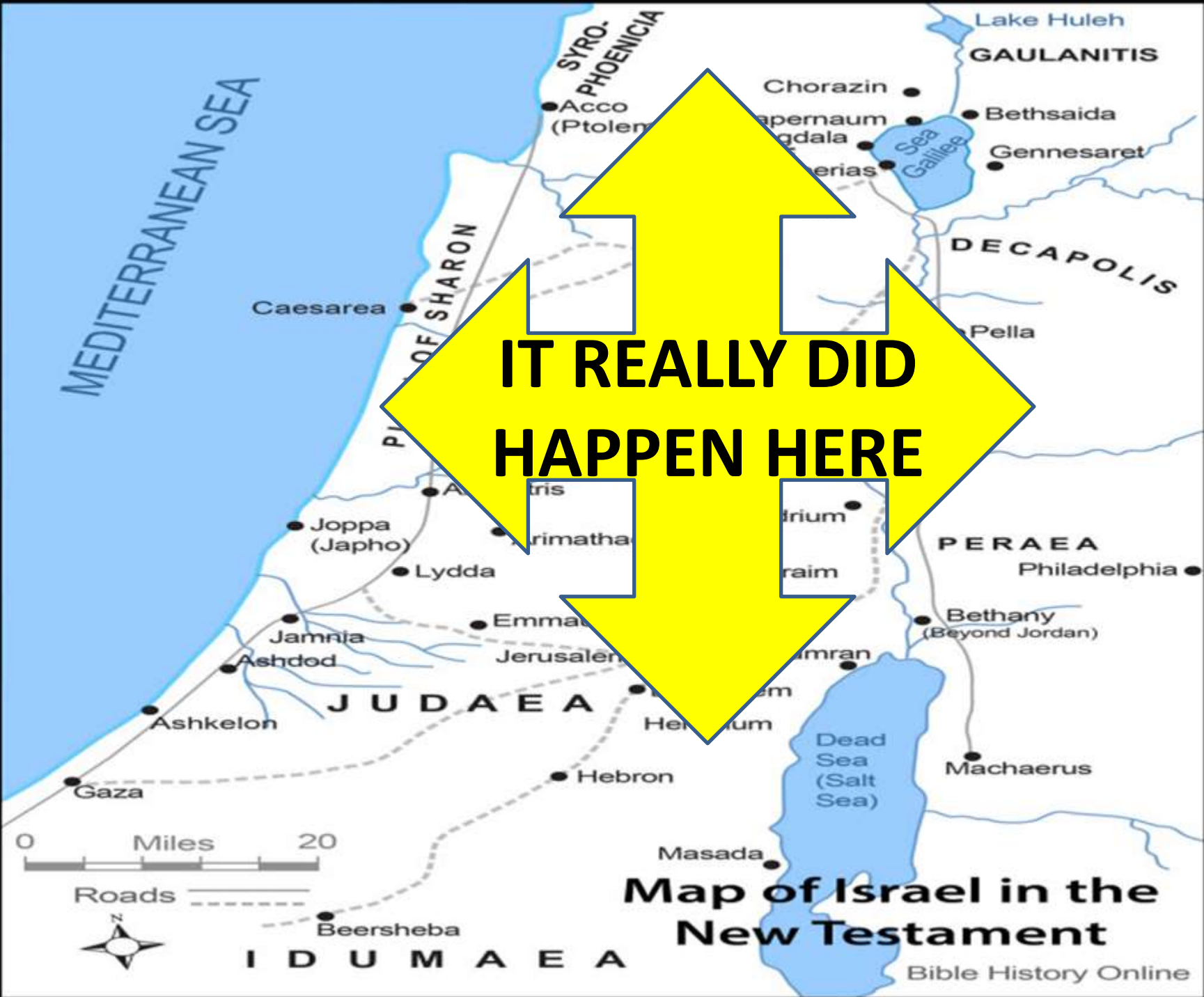
Map of Israel in the New Testament